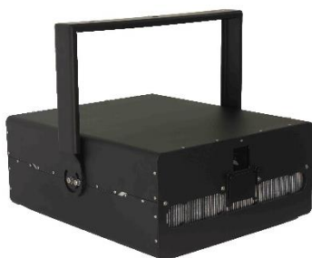
ARCHER RGB 20000

ARCHER RGB 40000 has 3 sub-models to fit the needs of different power range and budget.